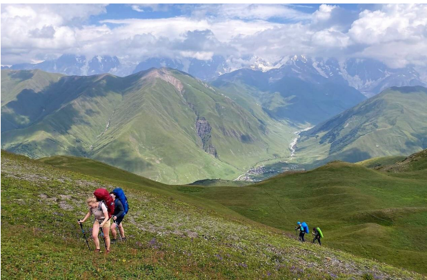
On the way to Gorvashi pass