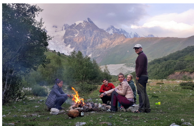
Camp in a birch grove

From Adishi, we will go up the Adishischala river. After two hours of hike with a slight elevation gain, we will set up the camp in a riverside birch grove at the foot of Adishi glacier. Here we'll cook a dinner on a camp stove and enjoy a wonderful evening surrounded by beautiful majestic mountains. Overnight: tented camp (2260 m).