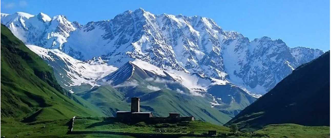
Lamaria church in Ushguli

Svaneti is one of the most beautiful and distinctive regions of Georgia. It is known for its incredible snow-capped peaks, blooming alpine meadows and picturesque settlements with famous medieval defense towers. Svaneti has a unique location with four out of the ten highest Caucasus peaks located in this region. It's where you can find the highest mountain in Georgia, Shkhara, standing at 5,203 meters altitude. It is a hiker's wonderland.