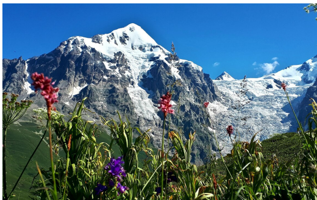
View of Mount Tetnuldi (4858 m) on the way to the Chkhutnieri pass

drive to the highest located village in Georgia, that is Ushguli (around 2300 m). In Ushguli, we will stay in an ancient house of our hosts and enjoy a dinner prepared by a hostess from fresh local products. Overnight stay in the guesthouse.