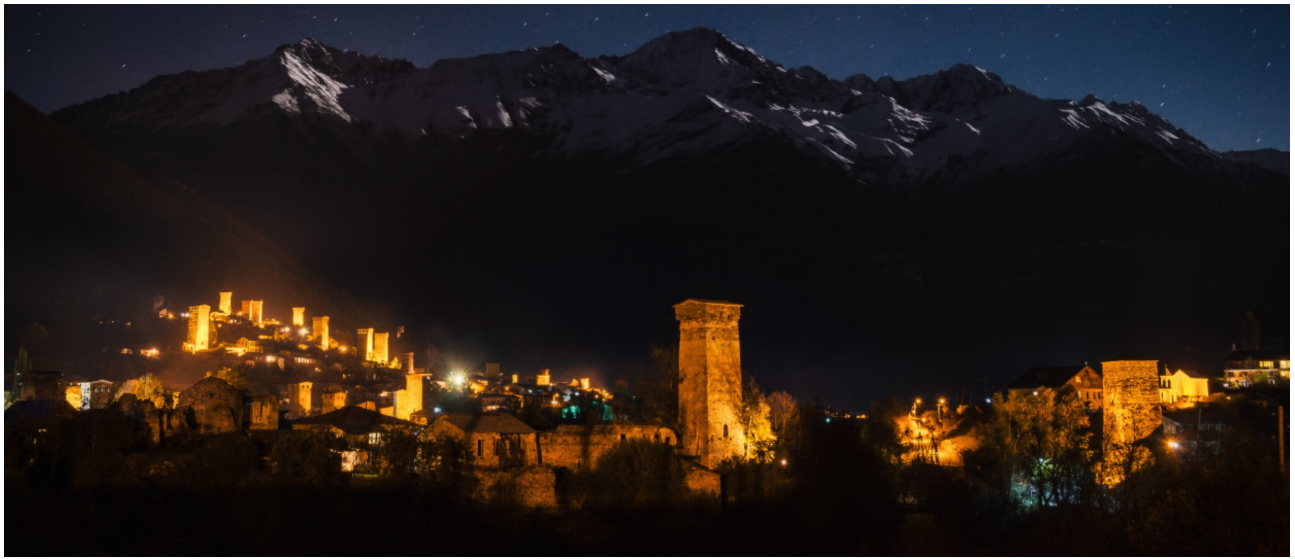
Mestia at night